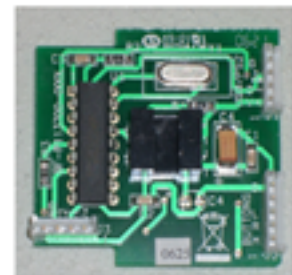
Trackball replacement PCB

Locate the replacement trackball X/Y Axis PCB we sent you (see diagram) and UNPLUG THE 2 WIRES that are plugged in to the PCB ON THE TRACKBALL PCB (the defective one).